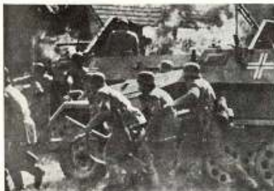
Nazi troops charge Communist positions in war against Soviets.

The ONLY times the reds have EVER been really WHIPPED, it took the new political "police force" of the White Man, --NAZIS, --to do it!