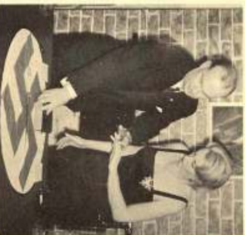
The cut ring fingers are held together, uniting blood.