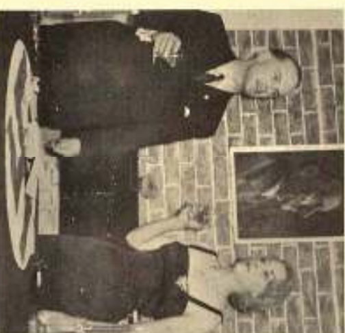
WUNS Deputy Leader addresses assembly after home.