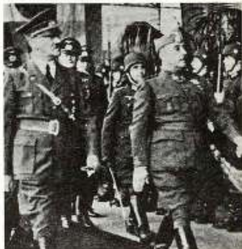
Side by side in fight against Communism, Hitler and Franco.

In Spain, Communism was whipped by the fascist "Falange", aided by the GUNS of Adolf Hitler.