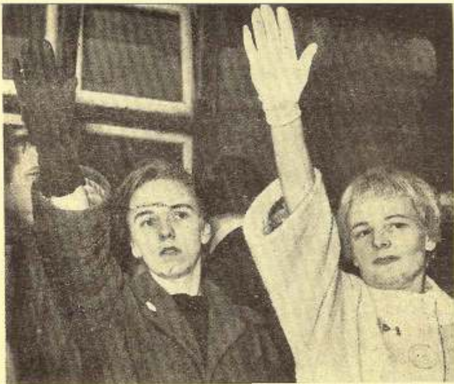
Here, pretty young Nazi supporters salute the wedded couple.